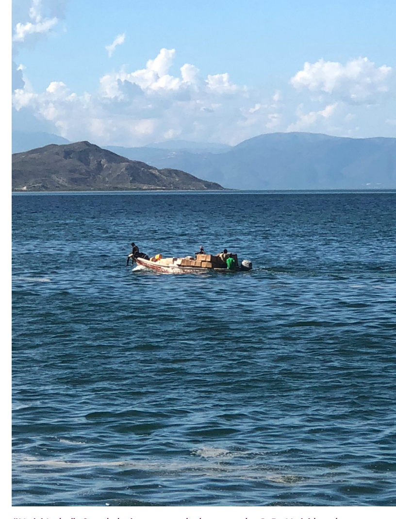
"Haiti Lake": Goods being smuggled across the D.R.-Haiti border via Lake Azuei.

Some projects carried out in the DR could be replicated in or extended to Haiti, including creating a center for food quality (complete with laboratory) in partnership with a