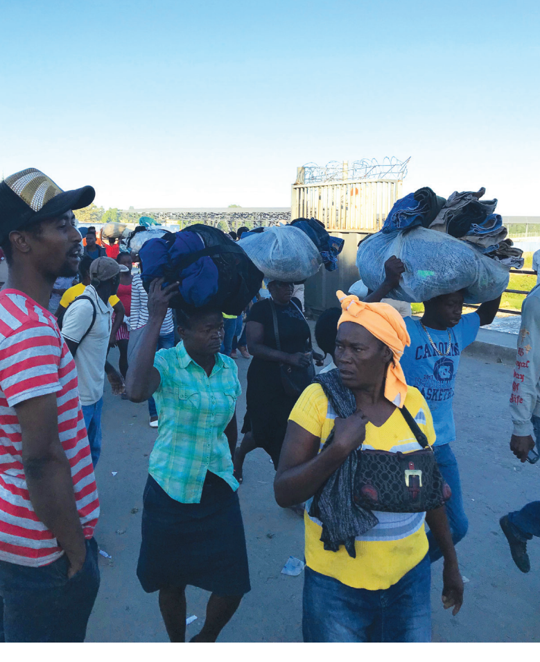
"DR Border Market": Haitians crossing the border at Dajabon to participate in the bi-weekly border market.

collection of taxes or fees. These commissions should provide anonymous hotlines or other means for traders to report corrupt demands by civilian, police, or military officials on either side of the border.